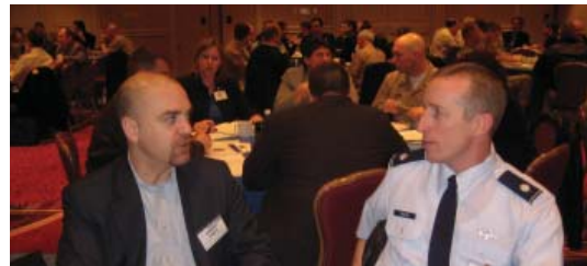
Bottom right: Civilian and military actors frequently share the same space and are increasingly cooperating on S&R missions.

However, congressional supporters have discussed allocating funds to create an Active Response Corps of 250 individuals and a Standby Response Corps of 1500-2500 members. Deployments would