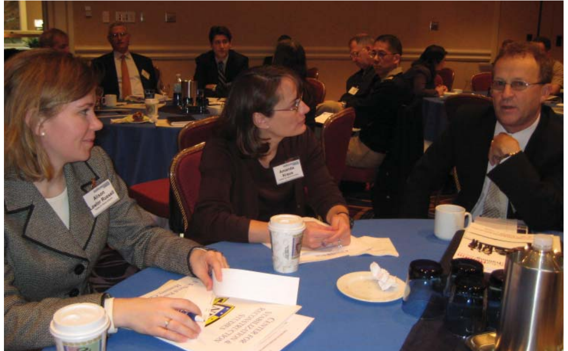
Top right: Civilian participants represented multiple branches of the US armed services, US and foreign government agencies, NGOs, and IGOs.