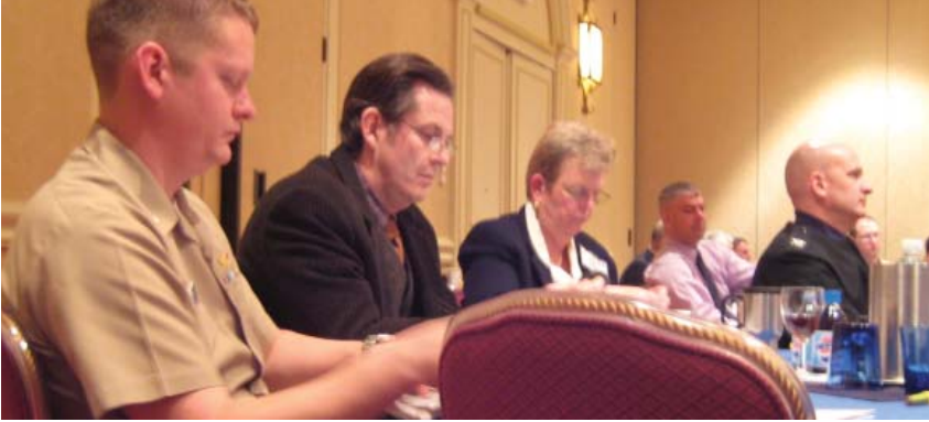
Above: Participants listened to leading thinkers share insights into the sea services' stability and security strategies, as well as offer best practices from successful operations.