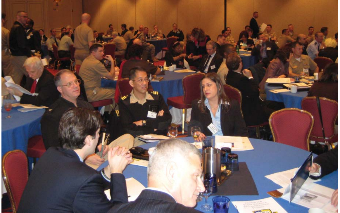
More than 230 participants, who represented a diverse range of S&R actors, attended the conference.

served by promoting peace and prosperity globally, and that these priorities must be addressed proactively so that they can be effectively developed, funded, and sourced.